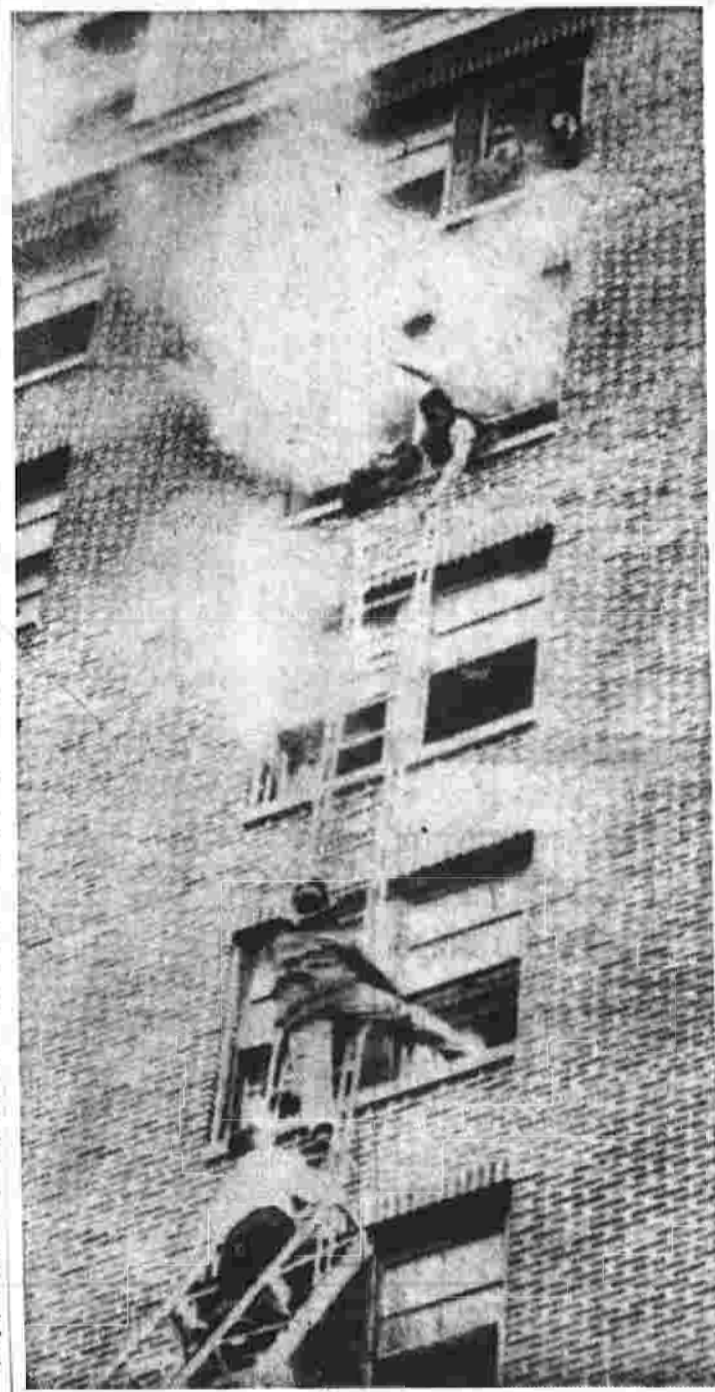
Firemen put up ladders in an effort to rescue guests trapped in the Jacksonville, Fla., Roosevelt Hotel fire yesterday.

The U.S. economy probably will expand 5 per cent to another record in 1964 and prices will remain fairly stable, says Secretary of Commerce Luther H. Hodges. Vice Adm. Hyman G. Rickover calls for changes in defense contracting rules to prevent what he terms excessive profits by some big companies. Congress of Racial Equality (CORE) says in Philadelphia it will take to the streets and physically halt the traditional New Year's Day Mummers parade if marchers are allowed to wear black face.