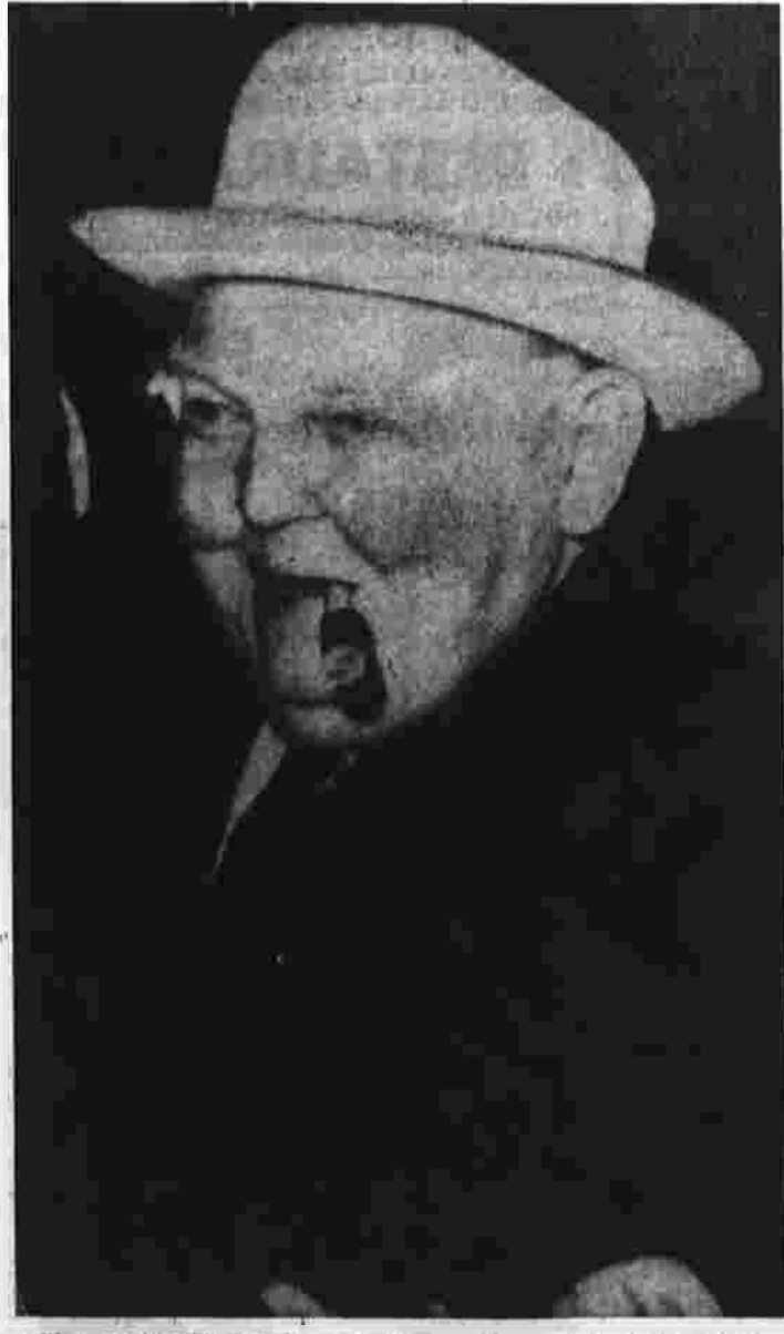
Chancellor Erhard poses in western-style hat given him yesterday by President Johnson at LBJ ranch barbecue.